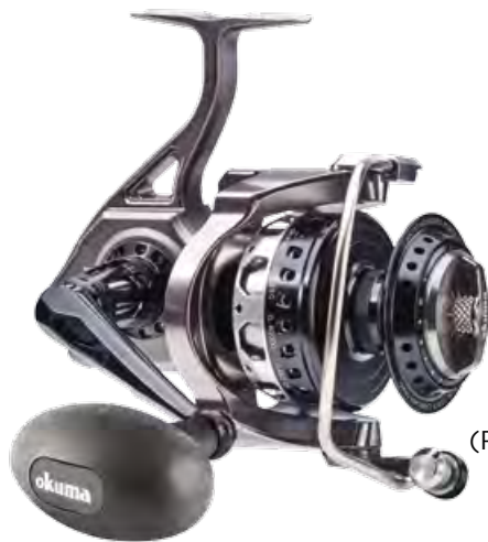
MK-10000R (Right Hand Model)