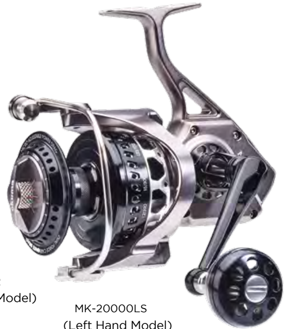
MK-20000LS (Left Hand Model)