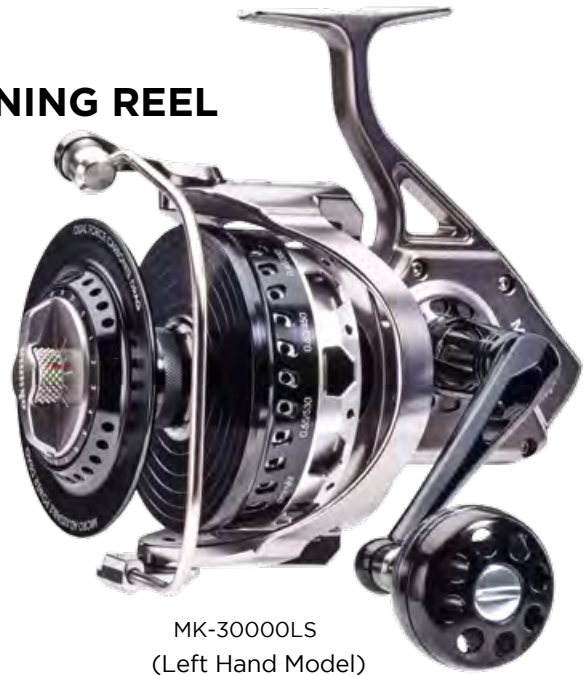
MK-30000LS (Left Hand Model)